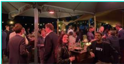
European Social Gathering