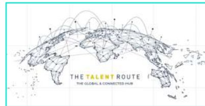
The Talent Route Initiative