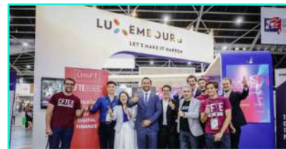
Singapore Fintech Festival