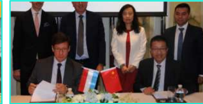
MoU W/ Tus S&T