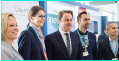
Opening Kirchberg offices