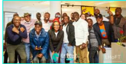
Catapult ! Program