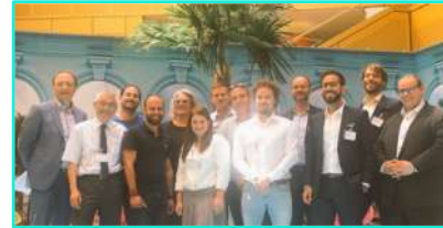
Fintech Awards W/ KPMG